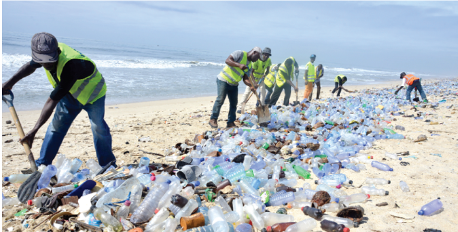
Plastic bottles washed off-shore in Ghana Credit: www.graphic.com (March 2019)

Environmental security is also a critical challenge to biodiversity and human livelihoods.