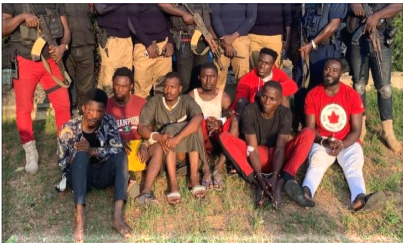
Eight suspected kidnappers of the two Canadians arrested by the security agencies in Kumasi

Another emerging threat in the country is the recent surge in kidnapping, abduction and drug abuse. Between January and May 2019, there have been 13 reported cases of kidnapping and abduction of women and girls in Ho, Tamale, Takoradi, Kumasi and Accra 10 . Additionally, three Ghanaian girls kidnapped in Takoradi, Western Region in August 2018, are yet to be rescued. Two Canadians were also kidnapped in Kumasi in June 2019 11 . These incidents have increased widespread anxiety and expressed public fear for life and security in the country. It further suggests that such vulnerable groups are increasingly targeted by organised crime networks in the country and even beyond.