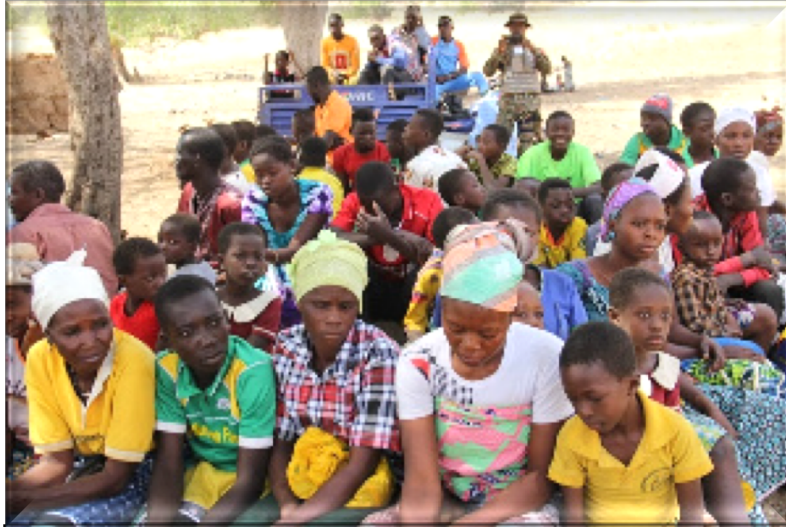
A section of the asylum seekers from Burkina Faso in the Bawku West District, Ghana

fleeing extremist attacks between January and June 2019 3 . Data generated from WANEP NEWS indicates that migrants, mainly women and children have settled in communities such as Tumu-Navrongo, Wuru, Kwapun, Banu, Pido, Kunchorkor and Basian communities in the Upper West Region 4 . The influx of migrants into these communities is escalating tension between residents and migrants over